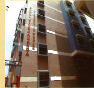
Swami Vivekananda Diagnostic Centre

To commemorate the 150th Birth Anniversary of Swami Vivekananda, we approached the Ministry of Culture, Govt. of India with our proposal to construct Swami Vivekananda Diagnostic & Cardiac Care Centre and Cath. Lab. The Ministry kindly sanctioned the whole project for Rs. 18.53 crores. The inauguration of Swami Vivekananda Diagnostic & Cardiac Care Centre with Cath Lab was held on 08-03-2015.