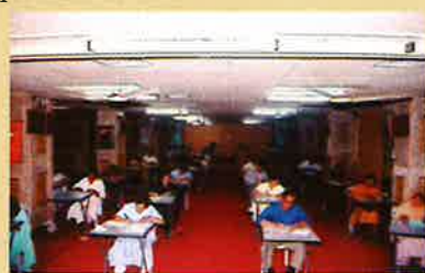
Gahanananda Hall (Examination in progress)