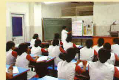
Nursing College Classroom

General Nursing-Midwifery Course : Candidates for admission are centrally selected through the West Bengal Joint Entrance Examination and placed in different Schools including this institution. The session normally starts in September and the course lasts for three years.