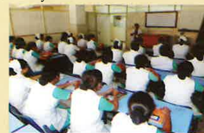
Nursing School Classroom