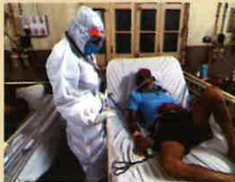
COVID Patient Under Treatment

With the support of Department of Health & Family Welfare, Govt. of West Bengal and Kolkata Municipal Corporation, we successfully completed the vaccination of the doctors, nurses and other health-care providers and inmates of this Pratishtan including the booster dose.