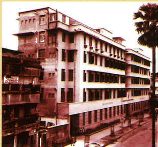
Hospital Building (in the year 1982)

In 1957, its Silver Jubilee Year, Sishumangal was renamed "Ramakrishna Mission Seva Pratishthan" following the addition of some general beds for men, women and children in 1956. Additional construction followed in phases and bed - strength also rose from time to time and reached 684 in 2020.