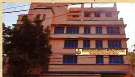
Vivekananda Institute of Medical Sciences

A new Superspeciality (M.Ch in Urology) has also been introduced (in place of DNB Urology) from the year 2022 with 2 permitted seats.