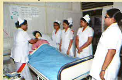
Practical Class (SON)