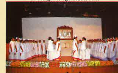
Capping Ceremony Programme at Dayananda Hall