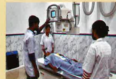
DRD Practical Class