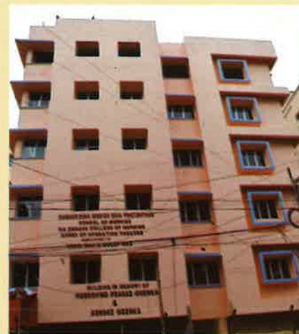
Yogin Maa & Golap Maa Building (housing classes for School of Nursing & Ma Sarada College of Nursing including top floor as Modular O.T., an extension of General O.T.)

Candidates for admission are centrally selected through the West Bengal Joint Entrance Examination (JENPAS-UG) and placed in different Colleges including this institution.